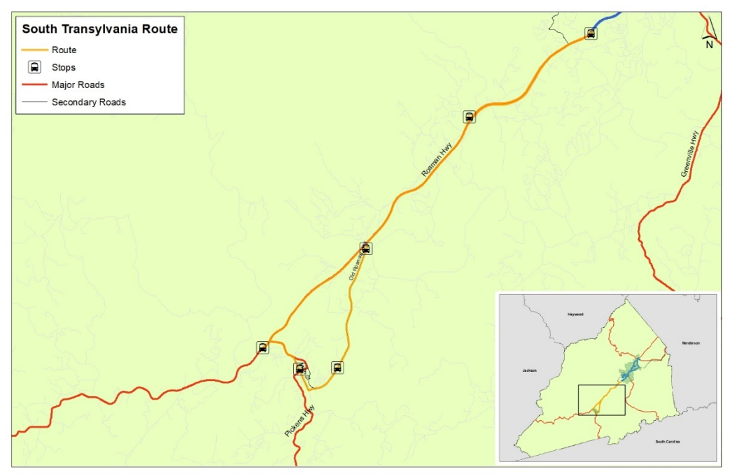
The South Transylvania Route, as shown below, will run three times per day. Round trip is approximately 16 miles. The route is subject to change based on feedback from NCDOT.

The North Transylvania Route, as shown below with the proposed locations, will run every hour on the hour except for 11:00 a.m. and 4:00 p.m. to make a southern route to Rosman. Staff is working with NCDOT to solidify some of the bus stops. Some could change based on feedback from NCDOT concerning safety issues and efficiency. The North Transylvania Route will provide transportation from Sav-Mor Foods on Rosman Highway to the Bi-Lo Shopping Center on Asheville Highway. The loop is roughly 16 miles.